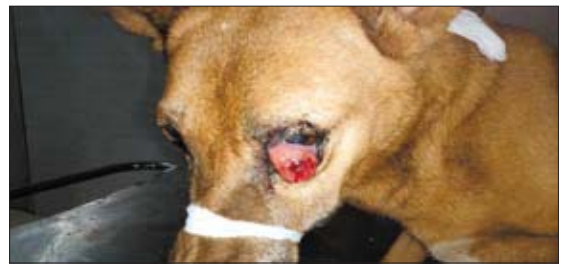
Fig. 1. Protruded tumor mass from the left eye prior to surgery