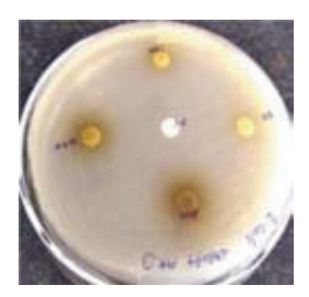
Fig. 2. Disc diffusion assay on E. coli

The methanolic extracts of B. sensitivum and from leaves of T. grandis were made by hot extraction process. Antimicrobial sensitivity was done using combination of antibiotic tetracycline and methanolic extracts of B. sensitivum and T. grandis . Study revealed that plant extracts alone did not have any antimicrobial activity, but when used along with the antibiotic tetracycline; both the plant extracts could potentiate the activity of tetracycline (Table 2). Among the three bacterial isolates tested,