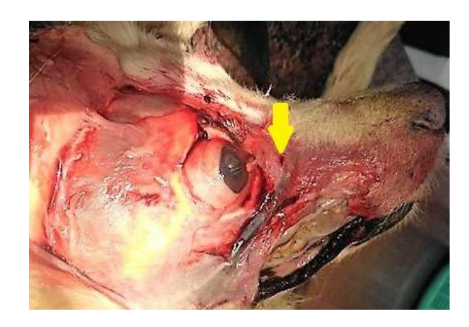
Fig. 1: Fang marks near medial canthus of eye (Arrow)

are the most frequently attacked and killed by the snakes (Osweiler, 1996). In dogs, frequently affected sites by snake bite are 64 percent in head and 13 percent in neck, 11 percent in forelimbs and prescapular areas, 7 percent in thorax/abdomen and 5 percent in hindlimbs (Willey and Schaer, 2005). The dog in this report had bite marks in the face. In viper bites, pulmonary haemorrhages, probably due to the action of haemorrhagins and disseminated intravascular coagulation, are the immediate causes of death (Benvenuti et al., 2003). Venom affects the capillary membrane permeability and facilitates fall in effective blood volume which results in multi-system organ failure (Thangapandiyan et al., 2013). Based on the history, gross pathology and histopathology, this case was diagnosed as bite by a snake belonging to Viperidae family.