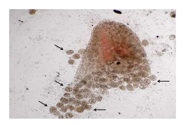
Fig 2: Schizont stage (single wall with little definition) of Eimeria spp. upon direct microscopical examination of intestinal scrapings.