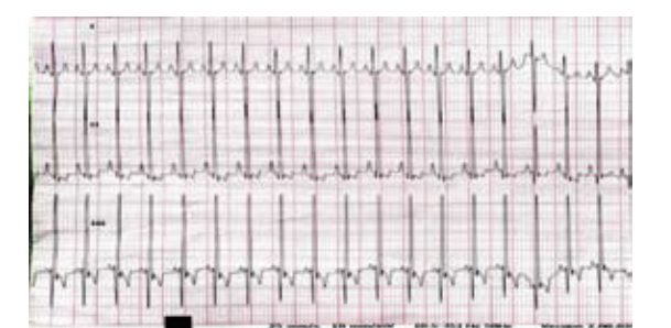
Fig 1. Electrocardiogram: P-pulmonale, increased R amplitude, deep Q wave in lead I and III, ST elevation indicative of bi-atrial and bi-ventricular enlargements and myocardial hypoxia.