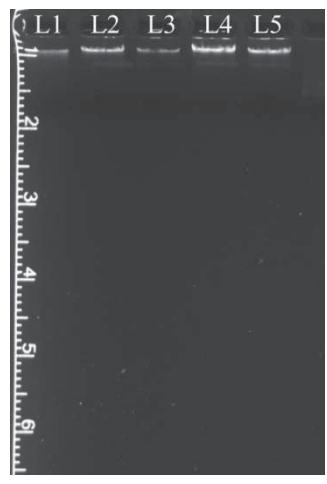
Figure 1: Lanes 1 & 2- DNA isolated with NS Lanes 3 to 5- DNA isolated with PBS

for higher recovery of nucleic acids from the columns. However this aspect could be ascertained only through studies with larger sample size. It was therefore concluded that both NS and PBS provided comparable DNA concentrations and that NS could be used if the latter is not readily available.