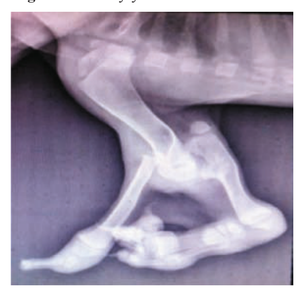
Fig. 2 Radiograph showing abnormal elbow and carpal joint

Medio-lateral radiographic view of left forelimb (Fig. 2) revealed splitting of the limb into two from the level of elbow with separation of radius and ulna along with the associated soft tissues, extending through the carpal joint. Ulna was short compared to radius. In the carpal joint, radial carpal bone was entirely separated from remaining ones.