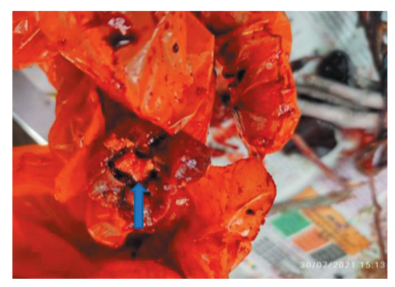
Fig.6 Gouty deposits in Parenchyma of Kidney