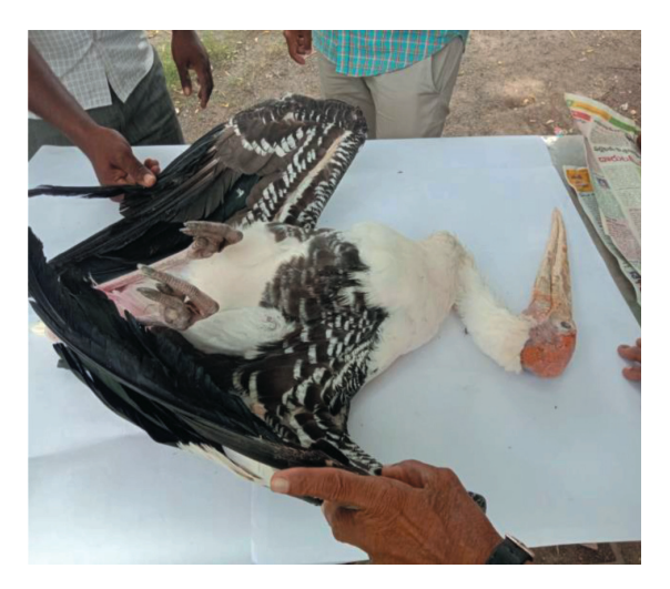
Fig. 1 Carcass of the painted stork referred from EEC, Kotappakonda for necropsy.

In July 2021, five painted storks ( Mycteria leucocephala ) were found moribund near the Painted stork enclosure