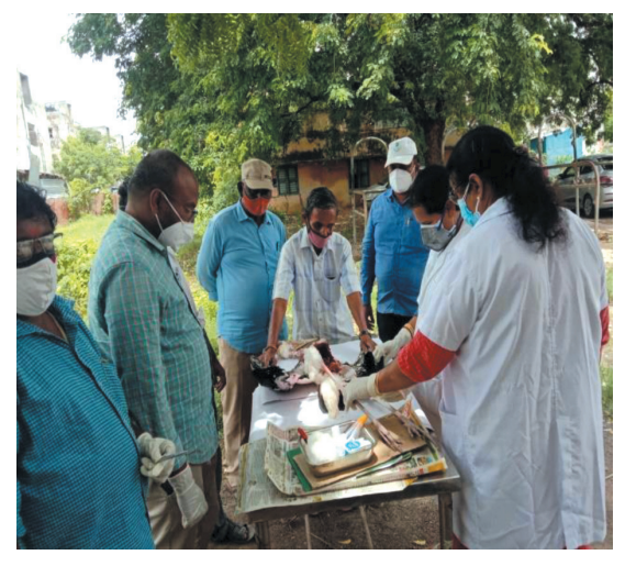
Fig 2 Collection of samples during necropsy of Painted stork

At necropsy, chalky white deposits were seen on the visceral organs like heart, kidney, liver, Joints and also in the Intestines. The heart was congested and visceral urate deposition was observed