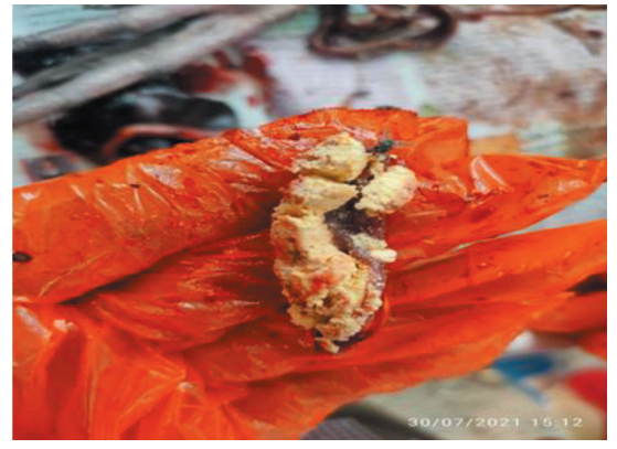
Fig. 5 Gouty deposits from the kidney