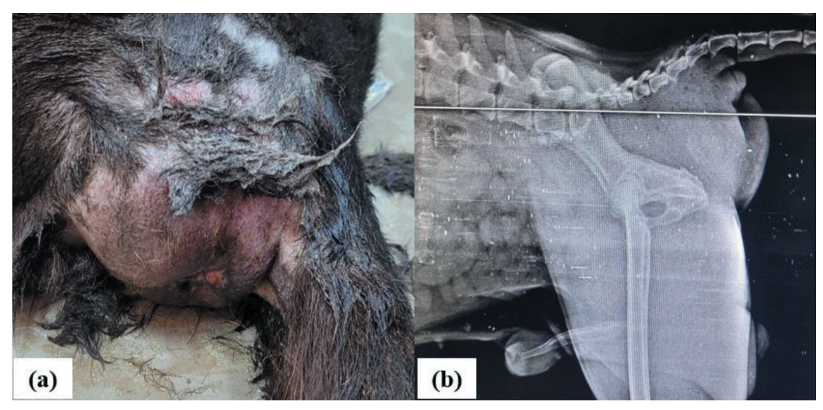
Fig 1: (a) Protruded mass on the left side of the anus. (b) Lateral abdominal radiograph revealed soft tissue opacity in the protruded mass and absence of bladder and prostate shadow in the caudal abdomen