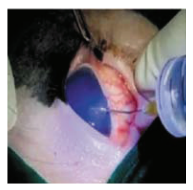
Fig. 4. Needle aspiration of the worm