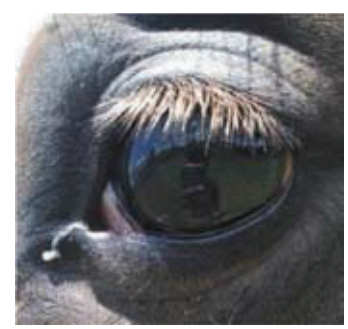
Fig. 8. Case 3: Complete corneal clarity after one month

The eyelids were retracted using ocular speculum to increase the visibility of the surgical site. By using a sterile keratome a small nick incision was made in the cornea at the level of 1-2 o' clock position (Fig. 3) and with the help of a sterile 18G needle aspirated the worm through the nick incision (Fig. 4). For one case, the corneal incision was made using 11 B.P. blade and the worm was flushed out from the anterior chamber. Corneal incision was kept open for postoperative days in three out of four cases and in the case which required a larger incision using the blade, the corneal incision was sutured using polyglactin 910 size 6/0.