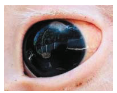
Fig. 7. Case 2: Complete corneal clarity after three months

mg/kg body weight intravenously. Animal was restrained in lateral recumbency with affected eye positioned upwards. Prepared the affected eye aseptically with povidone iodine collyrium (1:50). Auriculo-palpebral nerve block was given to prevent the eyelid movements.