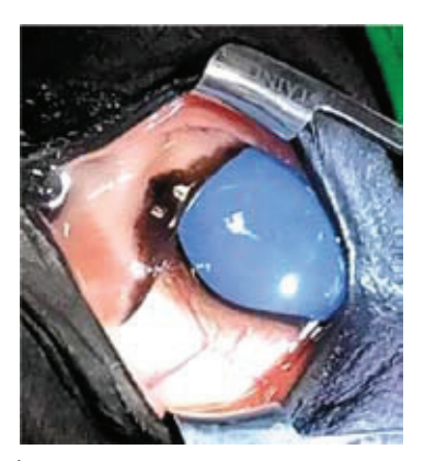
Fig. 1. Blue eye

All the animals were pre-operatively fasted (food withheld for twelve hours and