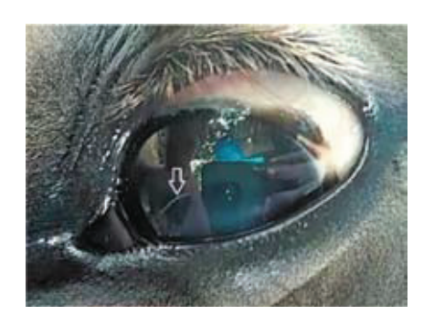
Fig. 2. Case 3: A white thread-like worm seen in the eye (arrow)