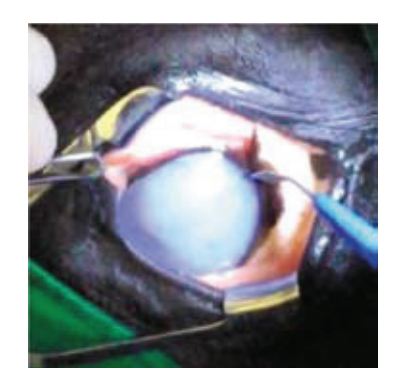
Fig. 3. Stab incision of cornea using keratome

water withheld for six hours). The animals were premedicated with inj. xylazine at the rate of 1.1 mg/kg body weight and inj. diazepamattherateof0.2 mg/kg body weight intravenously. Induction of anaesthesia was done with inj. ketamine at the rate of 2.2