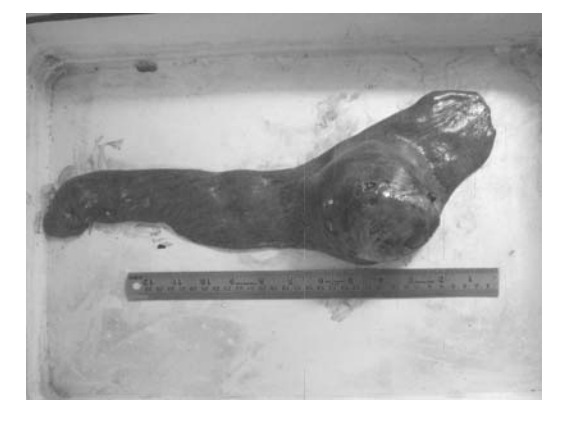
Figure 1: Spleen with tumour mass

A 13 years old lioness carcass was brought to the institute for necropsy from Lion safari park of Neyar wildlife Sanctuary with a history of sudden death. The animal was a bit lethargic and weak since a month but was feeding normally till the day of death. Necropsy examination revealed a solitary mass of 10cm diameter on spleen (Figure 1) with a rupture point at the centre of the mass on the ventral side. The tumor was soft, pulpy and dark reddish and cut surface bled profusely. Abdominal cavity contained 5-6 liters of blood tinged fluid. There was no gross evidence of distant metastases.