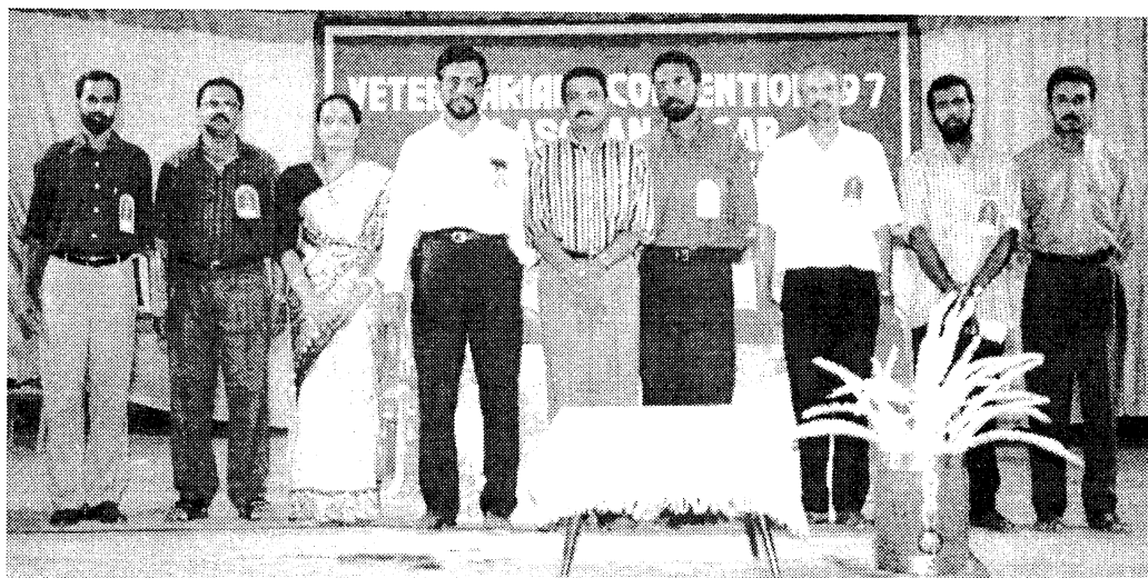
The team... New Office Bearers for 1998