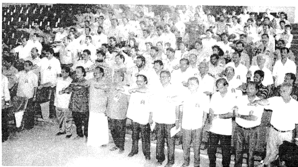
We solemnly swear..... Members taking Oath

Last but not the least part of the Veterinarians' Convention were the annual General Body meetings of Kerala Veterinary Surgeons' Service Association, and Animal Husbandry Officers' Association, Kerala, convened simultaneously in the different halls of the Convention venue. New office bearers were elected for both the organizations. Following these meetings, a sumptuous dinner was arranged in honour of the delegates.