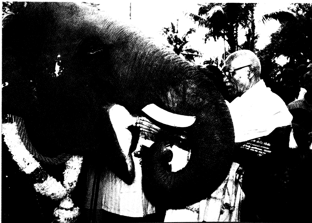
"Anayoottu"- ceremonial feeding of elephants