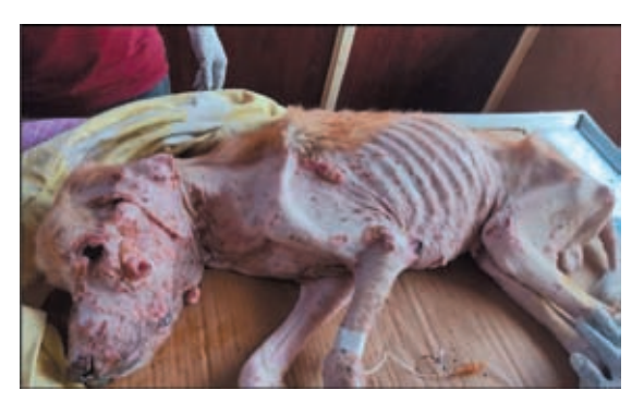
Fig. 1. Severely debilitated dog with generalized alopecia, raised plaques of variable thickness and ulcerative nodules all over the body