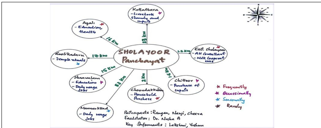
Fig. 2 Mobility map of Sholayoor Panchayat