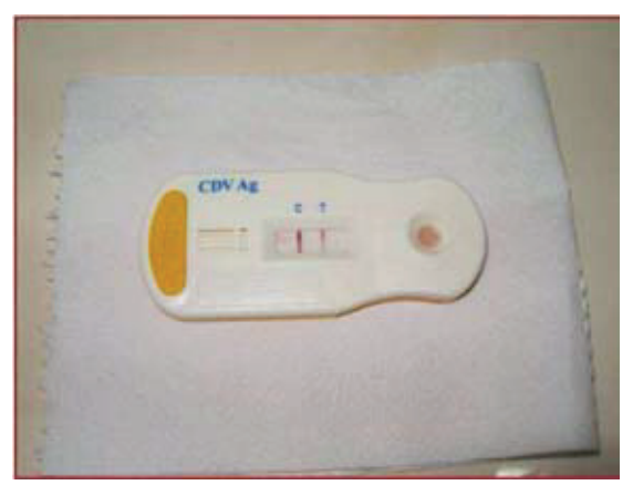
Fig 1: Rapid Immuno chromatographic Assay for CDV Antigen