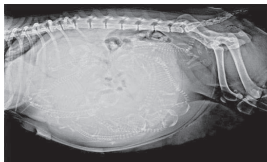
Figure 1. Fetal skeletons observed on radiography

days after the date of presentation of the animal to the hospital. However, a low fetal heart rate was an indicative of reduced