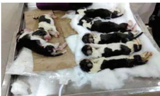
Figure 4. After wound dressing