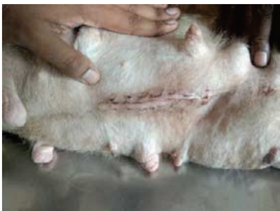
Figure 5. Six dead and two live puppies