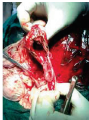
Figure 2. Uterine rupture detected on laparotomy